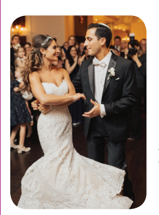
Bat & Bar Mitzvah 1 hour lessons Mother & Son Father & Daughter

(Additional charge if not in studio & have to travel to your location)